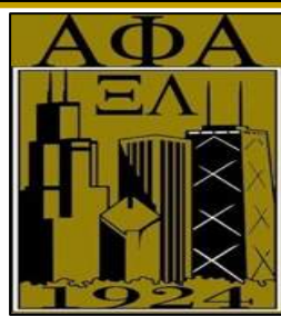
Kirby Jones Contributing Writer